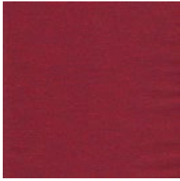
/21 LIPSTICK RED