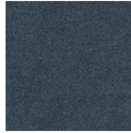
/40 DEEP SEA