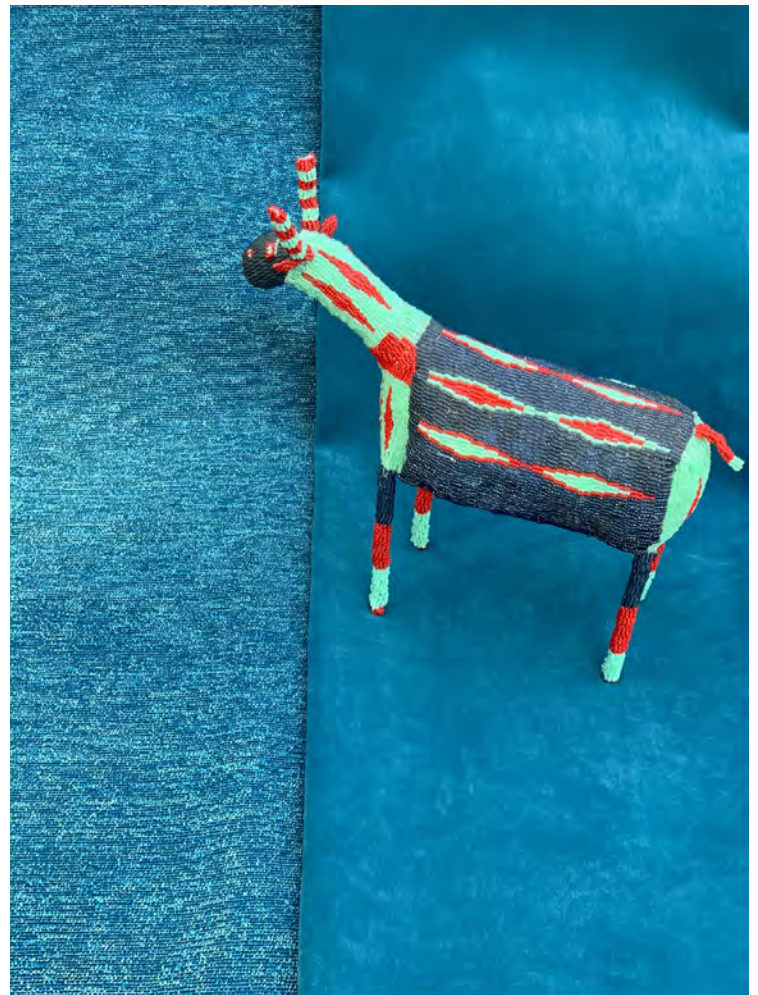
Bubbly & Suede Plush.jpg